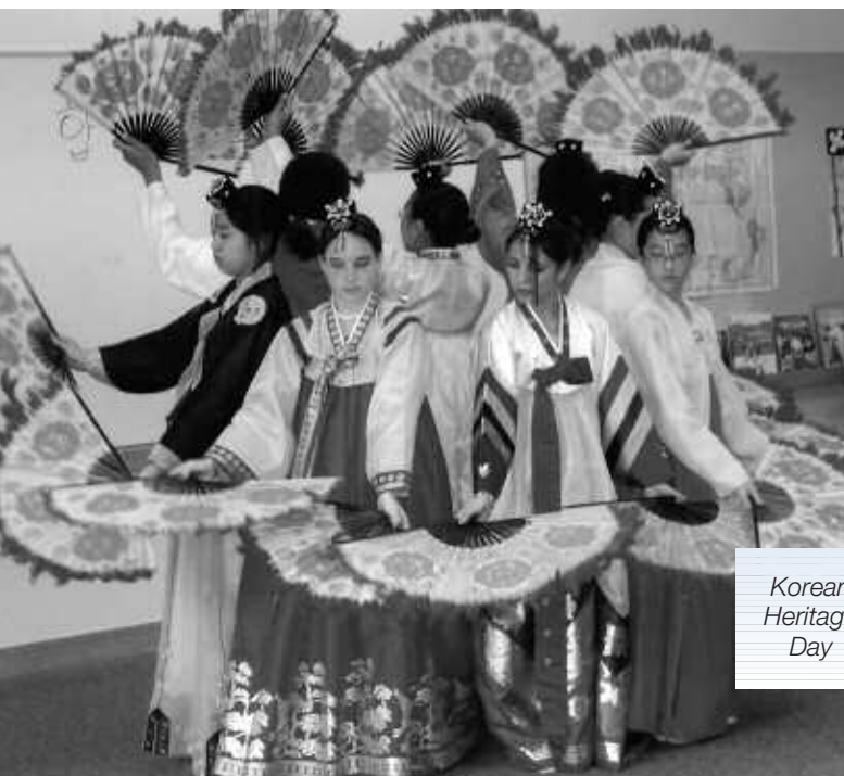
Korean Heritage Day

People find Pierce County libraries welcoming to browse book shelves, use the Internet, read, study, relax and hang out, in comfortable, friendly and clean places.