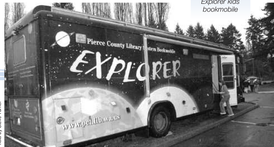
Explorer kids bookmobile