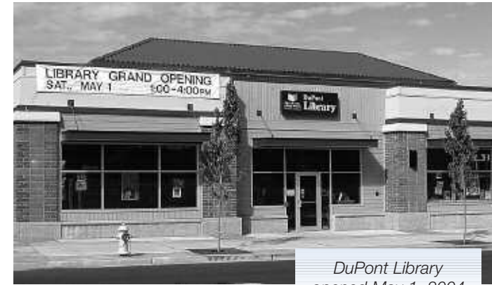
DuPont Library opened May 1, 2004