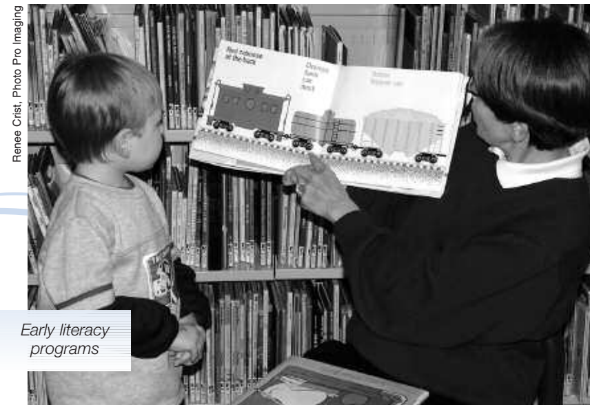
Renee Crist, Photo Pro Imaging